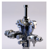
(ProX Piston Pump Shown)

Durable stainless steel piston pump delivers up to 3000 psi (207 bar) to spray the most challenging coatings